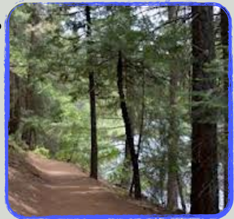
Trail to the waterfall...

If you don't want to camp you are welcome to come up for the day. We arrive on Tuesday no earlier than 2:30 p.m. and depart on Thursday no later than 12:00 p.m.